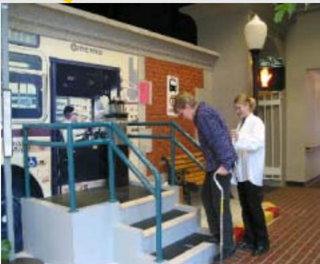
Patients learn to overcome life's obstacles under the guidance of our rehabilitation staff in a realistic environment.

Northwest Hospital & Medical Center is committed to ethical behavior in respect to the patient's right to participate and determine his/her own plan of care. To act for the well being of the patients and the members of the hospital's community. To provide fair, equitable, and appropriate treatment in accordance with the Law. To effectively and respectfully work with a diverse cultural and ethnic mix of patients, visitors, and staff. Northwest Hospital & Medical Center is a 504/ADA accessible employer. Auxiliary aids (sign language interpreters, readers) or alternate formats of written materials will be made available to person with disabilities, upon request.