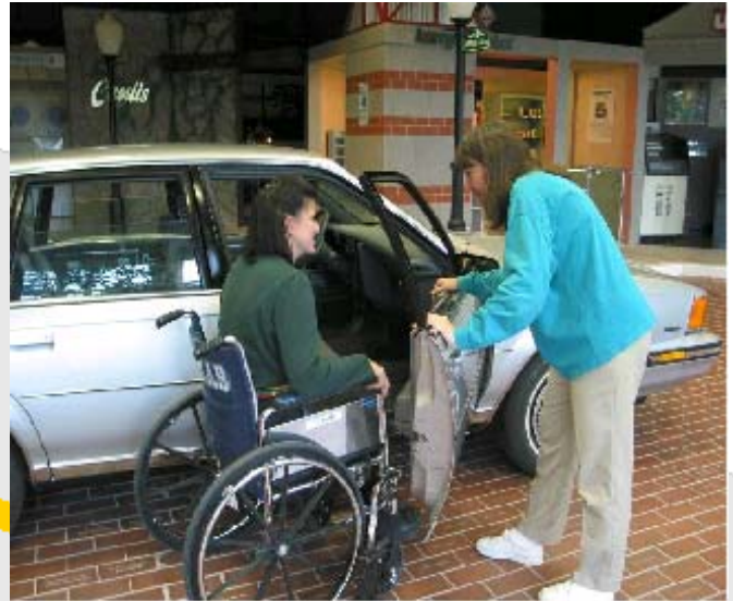
Patients practice getting in and out of a car in the security of a safe environment.

EASY STREET ENVIRONMENTS is an integral part of the comprehensive rehabilitation program offered at Northwest Hospital & Medical Center. Easy Street is a live-sized replica of a city street that provides a unique concept in medical rehabilitation. Individual modules include a grocery store, bus stop, greenhouse, laundromat, restaurant, theatre, and home with a kitchen, dining room, and bedroom. These areas of Easy Street incorporate real world obstacles including curbs, steps, ramps, slopes, and turnstiles. A physical therapy gym and occupational therapy center are conveniently located on Easy Street. The Easy Street Environments enhance the well-established rehabilitation program offered at Northwest Hospital & Medical Center, and is the only facility of its kind in Washington State.