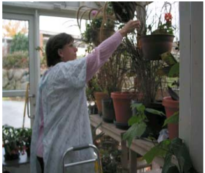
The Easy Street greenhouse provides recreational therapy, where patients have the opportunity to garden and keep their "green thumb".

As a leader in providing comprehensive rehabilitation services in the Seattle area, it is our goal to help patients return to productive lives - back to their homes, their communities, and their jobs.