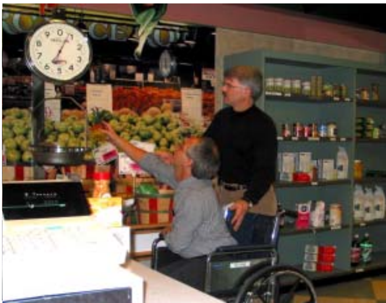
A cheerful, authentic grocery eases patients back into everyday activities such as selecting and paying for groceries.

community. The Center provides a safe, nonthreatening environment where weather limitations and transportation problems do not prevent patients from participating in the therapeutic activities needed to resume independent lives.